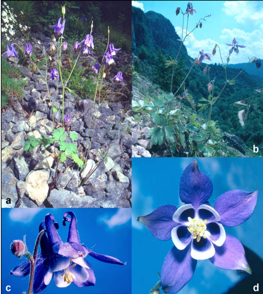
Fig. 2. - Aquilegia nikolicii (Niketić) Niketić & Cikovac from western Serbia: a) A. n. var. nikolicii from the Drina River canyon in vicinity of Bajina Bašta (Peručac village); b-d) A. n. var. panicii Niketić from the Beli Rzav canyon in vicinity of Mokra Gora (Kršanje village).

Aquilegia nikolicii (Niketić) Niketić & Cikovac, comb. et stat. nov. (Fig. 2) ≡ A. grata Maly ex Zimmeter subsp. nikolicii Niketić in Glasnik Prirodnjačkog muzeja u Beogradu B47: 57 (validated and designated in this paper) – A. grata auct., non Maly ex Zimmeter 1875