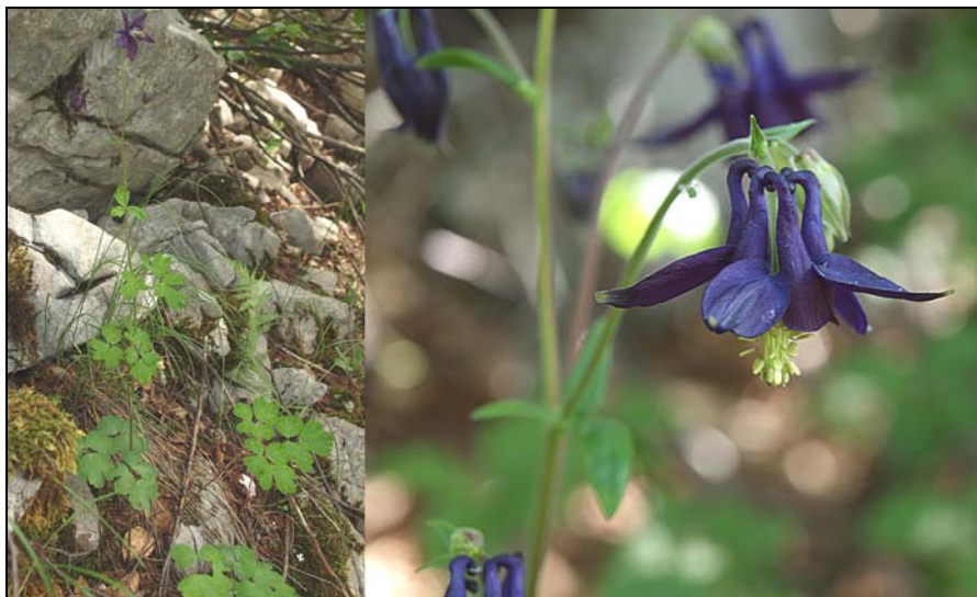
Fig. 1. - Aquilegia grata Maly ex Zimmeter from south-western Montenegro (Mt Orjen ).

from northern populations – subadriatic oromediterranean woodland habitats ( Seslerio autumnalis-Abieti-Fagetum ) versus saxicolous communities in subcontinental canyons ( Amphoricarpetalia, Arabidetalia flavescens ) 3 .