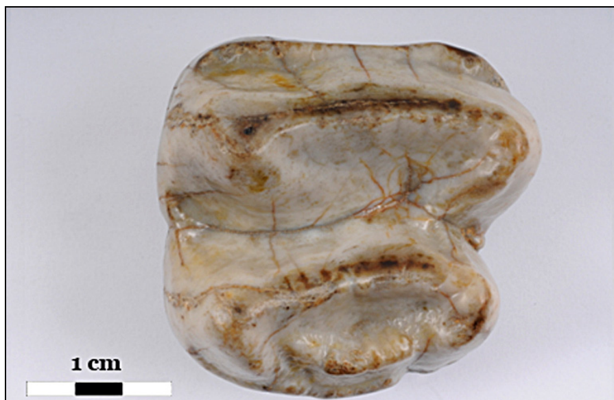
Fig. 2. - Deinotherium giganteum from fluvial deposits of the Zapadna Morava River in Adrani, near Kraljevo (central Serbia). Labial views of left M3 presented in the text.